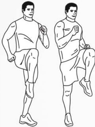
20sec high knees

Level I 3 sets Level II 5 sets Level III 7 sets | 2 minutes rest